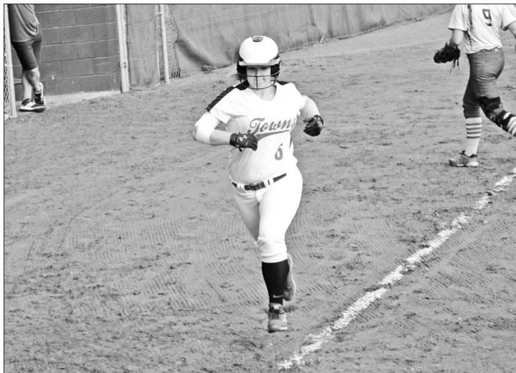
The Lady Indians have evened their record at 7-7 on the year.

"We would later score one in the third, two in the fourth ... and four more runs in the sixth."